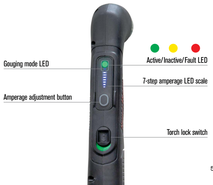
Gouging mode LED

New color-coded, quarter-turn cartridges can be changed out in about 10 seconds!