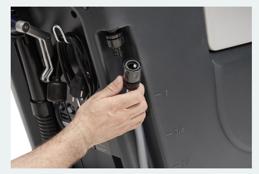
Solution hose is easy to disconnect and the solution tank can quickly be filled with water

SC530 comes in two versions: Non-traction and traction. The traction version grants easier maneuverability and allows effortless driving control for the operator.