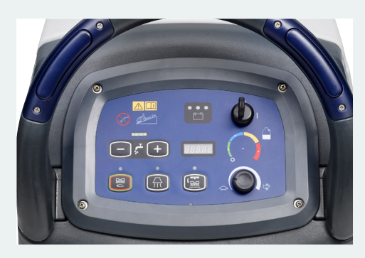
Solution flow regulation can be change from the driving position according to the floor type and level of dirt