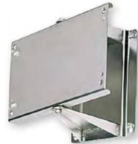
Art.no. 39605 Art.no. 39602