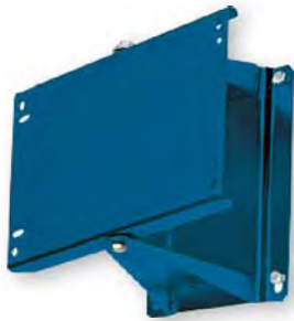
Art.no. 39502 Art.no. 39500