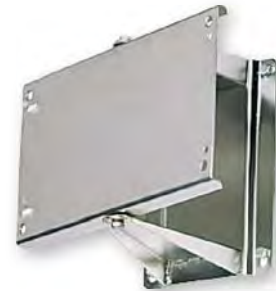
Art.no. 39602 Art.no. 39601