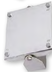
Art.no. 39600 Art.no. 39601