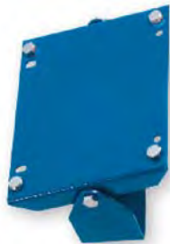
Art.no. 39535 Art.no. 39502