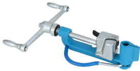
C00169: Standard Banding Tool