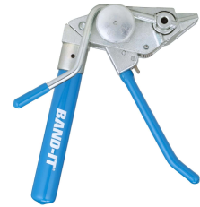
C07569: Bantam Tool