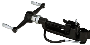
C00369: Heavy Duty Banding Tool