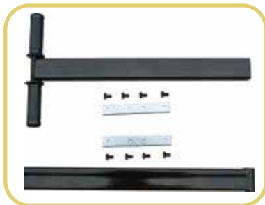
Two piece sturdy handles for compact packing and shipping